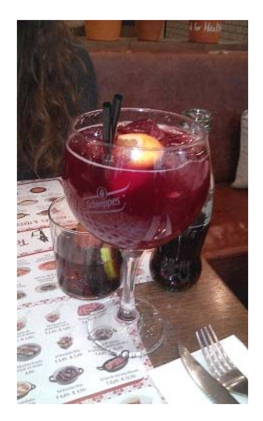
A typical Spanish sangria drink, it's an aperitif made of red wine and fruit mixed with water