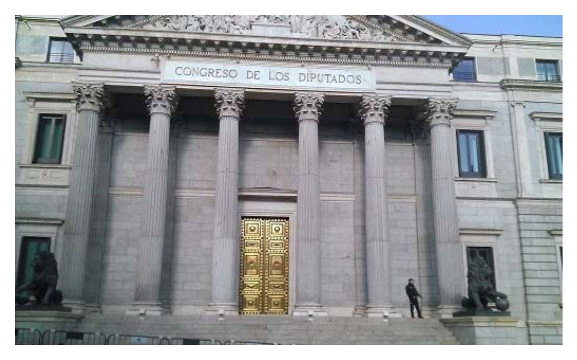
It is the Congress of Deputies of Spain, where is held all powers.