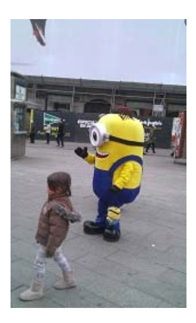
This place is the best known in Madrid, it is highly visited, there are many people and characters from animated drawings.