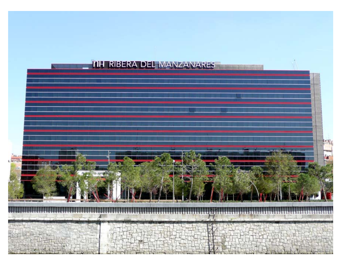
The hotel where I was working with Claire