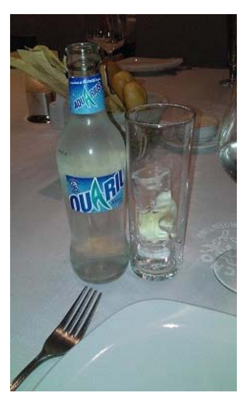
The Aquarius is the typical Spanish soda, it is lemon water