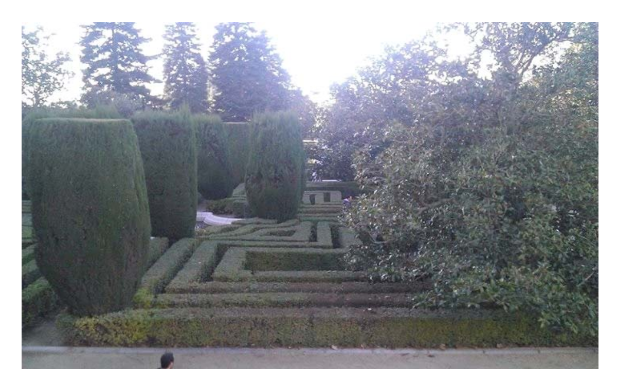
Cibele's garden is next to the palace, one can admire from there, this garden is a kind of labyrinth.