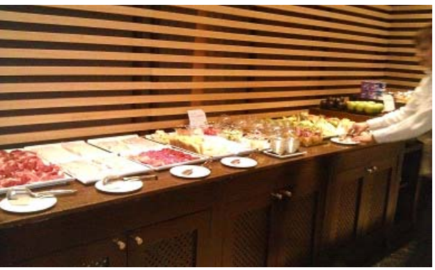
The bread, butter and jam