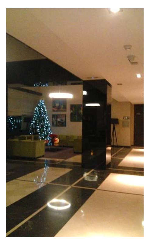
The entry hall