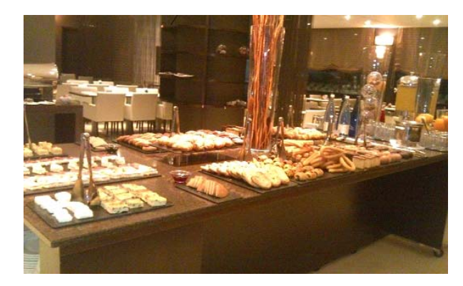
The pastries and the toast