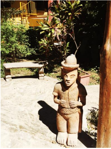
The typical statue of Costa Rica