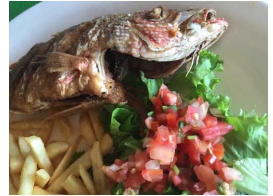
Fried fish with french fries and tomato salad

There are a lot of French people in the Guanacaste region ! All French people know the other, his activities or where he lives. It's a big community and you can be more easily friends than in France, because you have the same ambition : to succeed in Costa Rica.